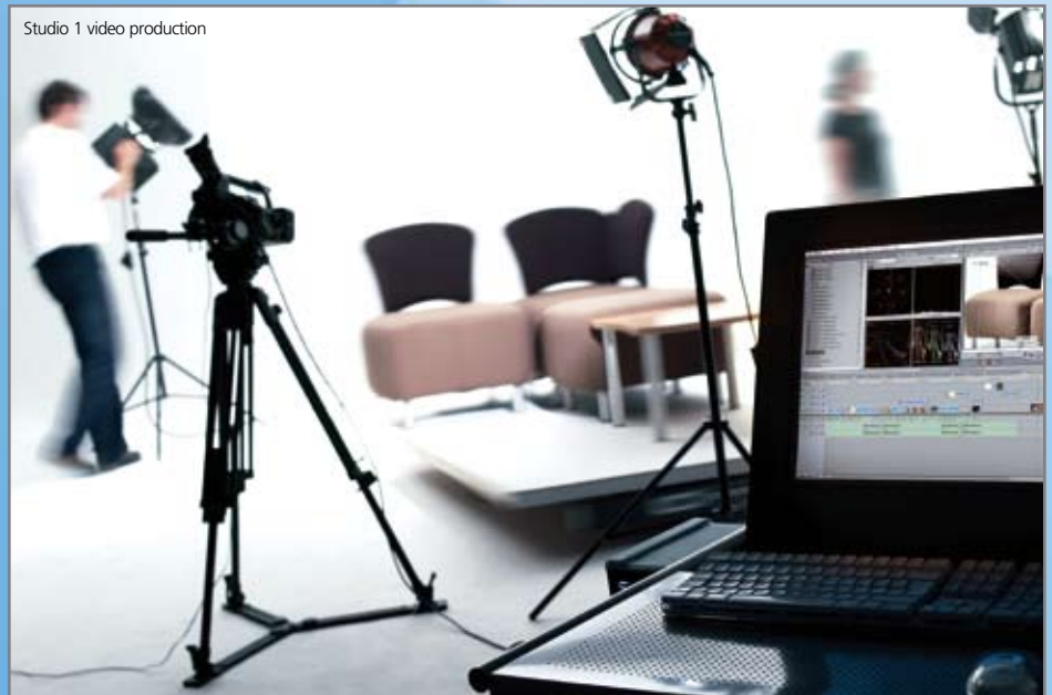
Studio 1 video production