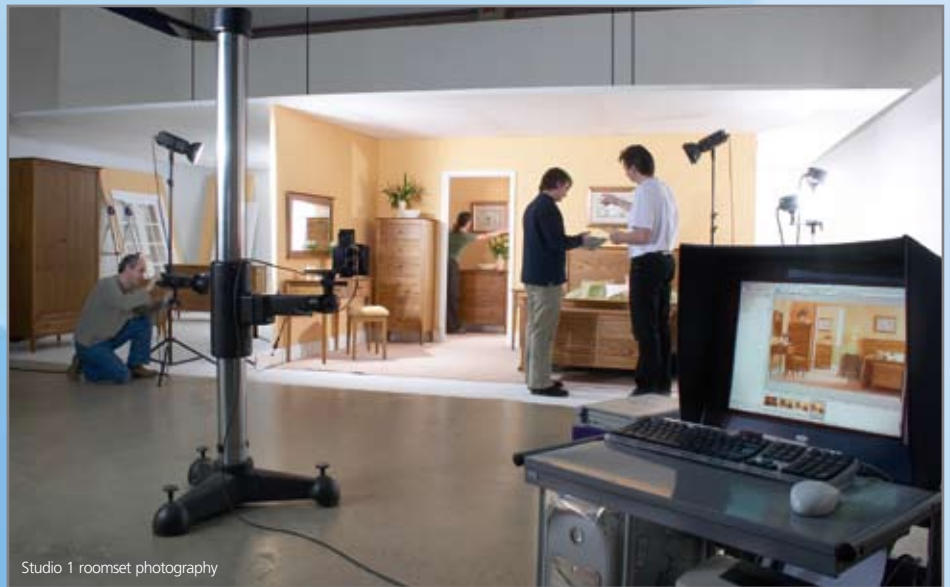
Studio 1 roomset photography